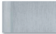
101 - AN Alluminio anodizzato Anodised Aluminium Aluminium EV1