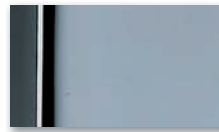
701 - IL Acciaio inox lucido Polished stainless steel Edelstahl poliert