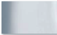
604 - CP Cromo perla Chrome perla similar Alu Chrom perla ähnlich Alu