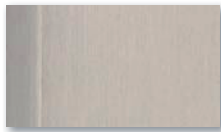
107 - NS Nickel satinato Satin nickel Ähnlich Edelstahl matt