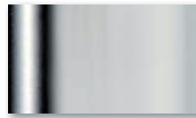
700 - IX Acciaio inox satinato Satin stainless steel Edelstahl matt