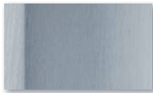
602 - CS Cromo satinato Satin chrome Chrom matt