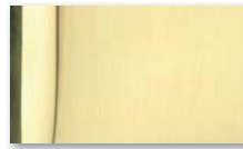
502 - OL Ottone lucido Polished brass Messing poliert